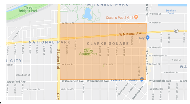
For more information, visit clarkesquare.org.

Clarke Square is a diverse and creative urban neighborhood on its way to prosperity. The area offers affordable housing from single-family to multiunit homes with rental income options.