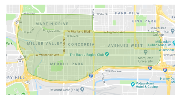
For more information, visit nearwestsidemke.org.

The Near West Side is connected to all the City's major interstates and thoroughfares with deep historical ties, iconic architecture, anchor institutions, and dynamic growth.