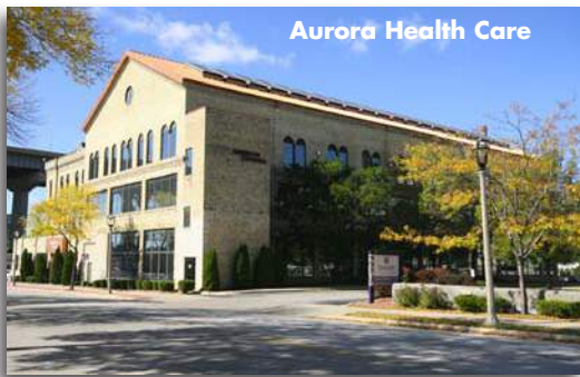
Aurora Health Care

Menomonee Valley Industrial Center reaches jobs goal , a milestone for job creation. In 2006, Menomonee Valley Partners worked with the City of Milwaukee to adopt development objectives, execute careful site planning, and develop a focused business recruitment strategy that set the course for creating 1300 family supporting jobs on this 60-acre site. With the announcements that J.F. Ahern and Suzy's Cream Cheesecakes plan to develop here, becoming the 8th and 9th businesses in the industrial center, the jobs goal was reached. The Menomonee Valley Industrial Center still has seven more acres available for sale and additional job creation potential.