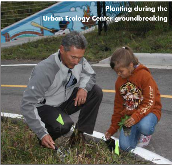
Planting during the Urban Ecology Center groundbreaking

Funding milestones were met through a groundswell of support. In 2011, leadership gifts were received from the Burke Foundation ($2.3 million), an Anonymous donor ($750,000), the Joseph & Vera Zilber Family Foundation ($500,000), the Herzfeld Foundation ($500,000), and a number of other individuals, corporations and foundations. Rexnord, which contributed $400,000 and $100,000 in materials through their Zurn subsidiary, also issued a Valley business challenge grant that leveraged an additional $100,000 and $47,000 in donated products from smaller Valley businesses.