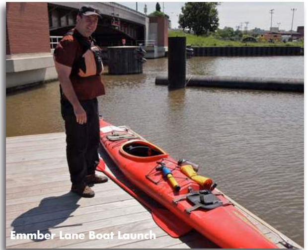
Ember Lane Boat Launch

Broad partnership created new access to the Menomonee River in the heart of the Valley. For a decade, the area where the Menomonee River crossed under Ember Lane had been filled with trash and debris, creating an eyesore. Today, there