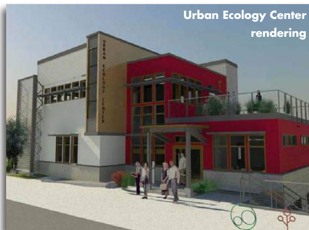
Unleash Wilson Architects

Establishing a third branch of the Urban Ecology Center , an organization that fosters ecological understanding as inspiration for change, neighborhood by neighborhood. The Center, which served 80,000 visitors in 2011 at its two existing branches, revitalizes urban parks with daily hands-on science education through school partnerships and after-school, evening and weekend community programs. These programs improve academic performance, provide safe places for kids to play and learn outdoors, expand environmental understanding, and deter crime. The Valley branch will open in fall 2012 in a renovated building. Funds raised through From the Ground Up will support five years of programming for the branch. What was a vacant tavern will become a sustainably designed community center and an anchor for positive change.