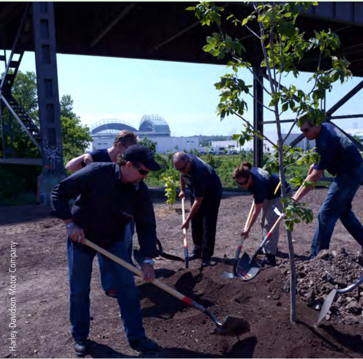
Harley-Davidson Motor Company