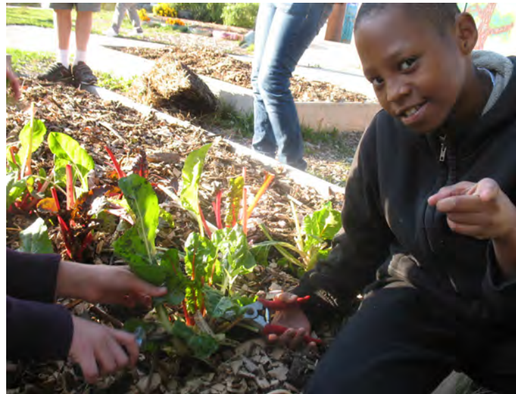
Urban Ecology Center

In summer 2014, Menomonee Valley Partners and Urban Ecology Center will construct new features in Three Bridges Park, including community gardens, learning pavilions, picnic tables and a native plant nursery to support the park's land stewardship for years to come. Located just east of the 35th Street viaduct, the community garden area will become a hub of community activity and a launch point for outdoor educational programs. Students at Bradley Tech will help construct the raised beds in time for the 2014 growing season.