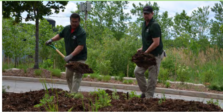
Potawatomi Bingo Casino

Company introduced the city to Three Bridges Park through their performance Acts of Wilderness . As part of Wild Space's new Neighborhood Sites initiative, designed to engage residents and businesses in developing site-specific events that enhance their neighborhood's image and role in the city, Wild Space's choreographers used the natural shapes and vistas to present a meandering walk through Three Bridges Park, capturing the juxtaposition of nature and industry, secluded spots and open vistas.