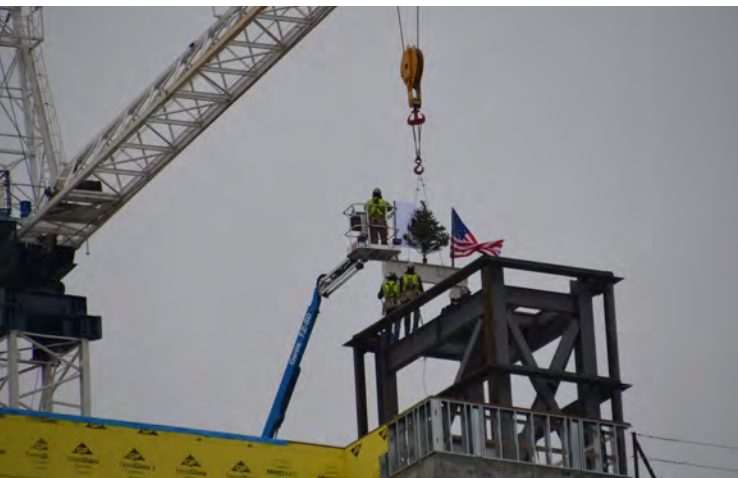
Potawatomi Bingo Casino