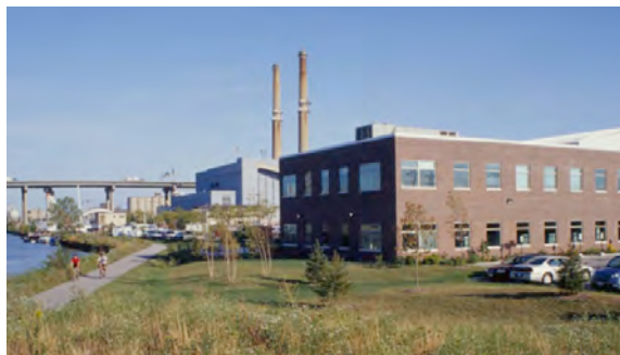
The Sigma Group

overcome development obstacles and prioritize efforts for the next phase of revitalization. This planning effort will last through 2014, starting with market research, stakeholder interviews, public meetings, and surveys. The plan will set a vision for St. Paul Avenue, riverfront redevelopment and priority properties – with a continued focus on sustainability.