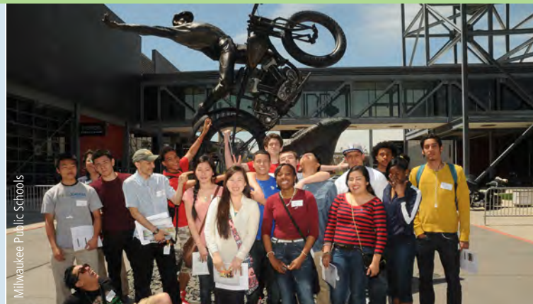
Milwaukee Public Schools

Menomonee Valley Partners' programs help businesses and their employees thrive, create connections to surrounding communities, demonstrate sustainability, and make the Valley a destination for the greater Milwaukee community and beyond. Highlights of our work in 2013 include: