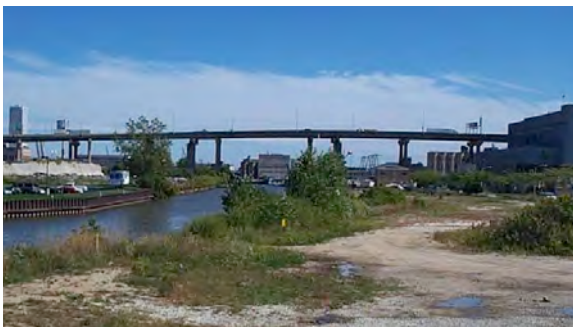
The Sigma Group