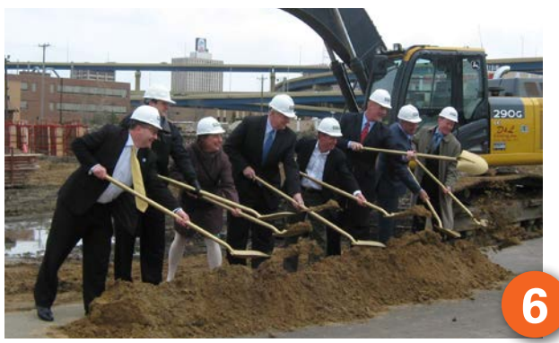
222 N Emmber Ln

Standard Electric Supply Co, a third-generation, family-owned business, was a pioneer when it moved to the Valley 30 years ago. They started a $4 million expansion in April to add 21,000 square-feet to the facility. The company employs 75 people in this location and will soon have the capacity to double its staff.