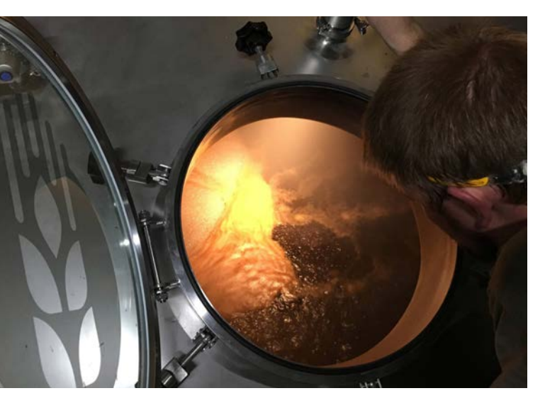
On the cover and above: The first brewing day at Third Space Brewing.

Partners who believe in the Valley contribute to the job growth, environmental restoration, and